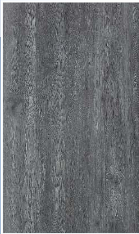
PWF - 1021 Wooden Series