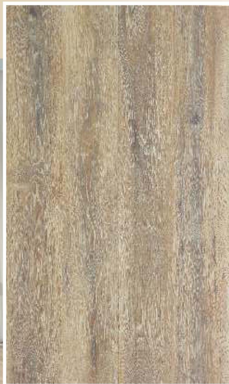
PWF - 1009 Wooden Series